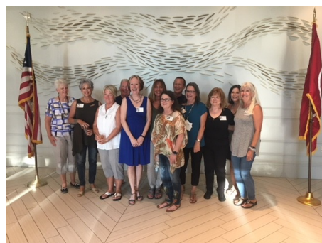
The Girls, well mostly, at the reception Friday night.