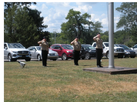
Central High School ROTC Color Guard Honoring the Lost Cadets from the Classes of 1968 and 1969.