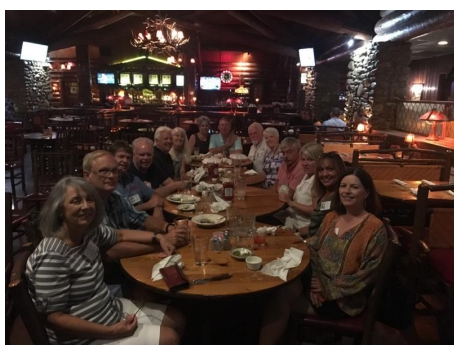
A group from the 70's at the Sportsman's Lounge Friday Night