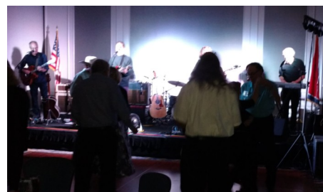
Fab Nashville entertaining the crowd with their Beatles Cover Entertainment Saturday night after the Banquet.