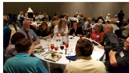
More Banquet Fellowship