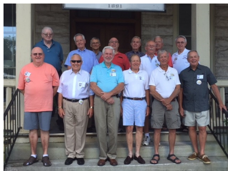
The Class of 58 had a great showing for their 60th Reunion. This is 14 of the 18 that made the Reunion.