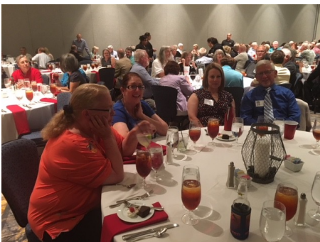
Saturday Night Banquet