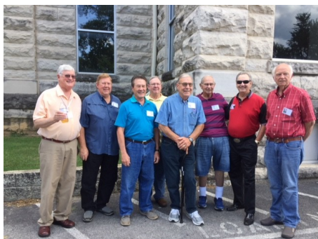
A group from the Classes of 1961-1963