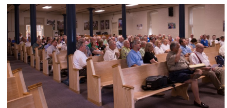
Alumni gathered in Old Main for the General Membership meeting on Saturday Morning.