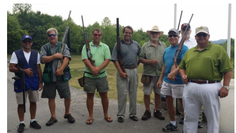
Some of the alums that took on the reunion's newest event, the Sporting Clays Shooting Competition.